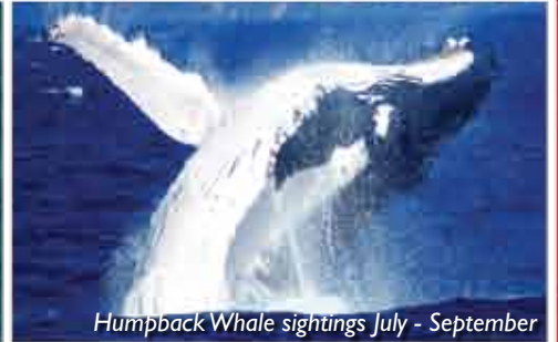
Humpback Whale sightings July - September