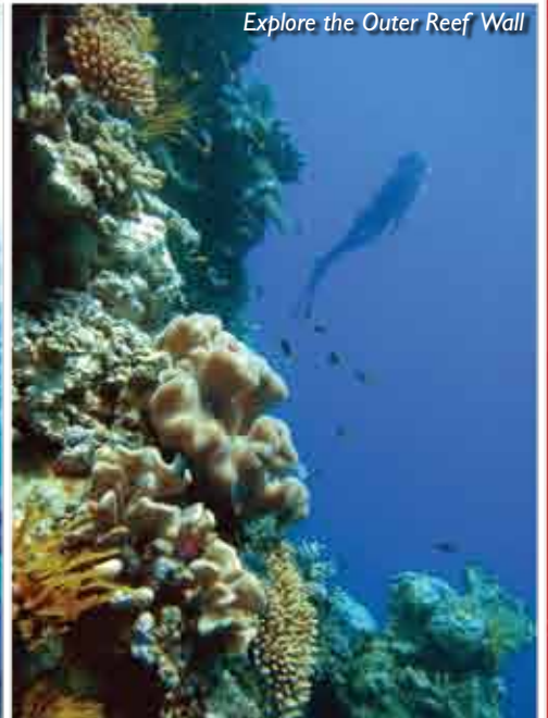
Explore the Outer Reef Wall