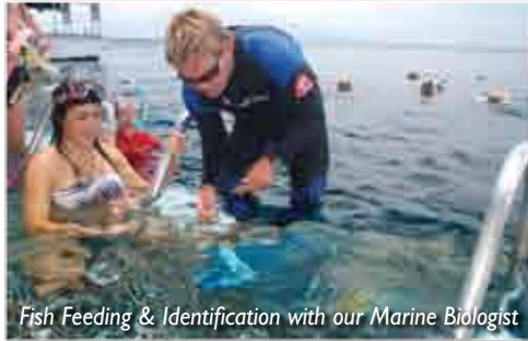
Fish Feeding & Identification with our Marine Biologist