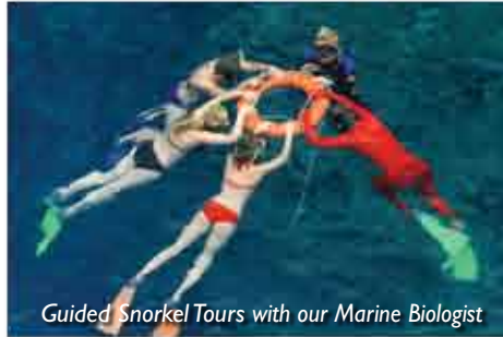
Guided Snorkel Tours with our Marine Biologist