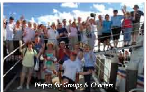
Perfect for Groups & Charters