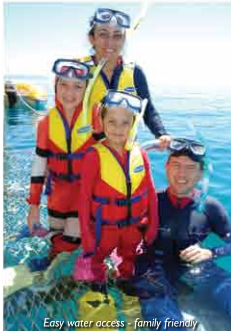
Easy water access - family friendly