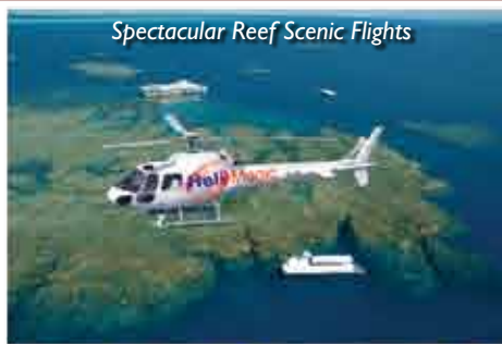
Spectacular Reef Scenic Flights