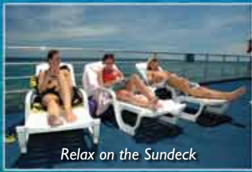
Relax on the Sundeck