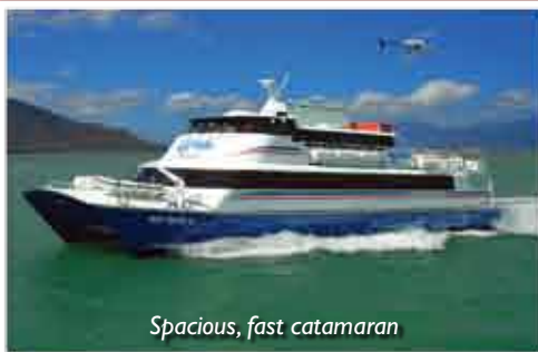
Spacious, fast catamaran