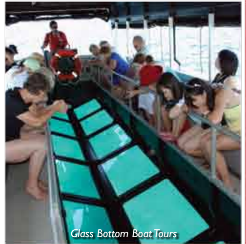
Glass Bottom Boat Tours

Advanced Ecotourism Accreditation distinguishes us as one of Australia's leading and most innovative ecotourism products. Your patronage helps support important conservation initiatives aimed directly at the protection of Australia's natural heritage.