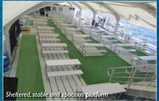
Sheltered, stable and spacious platform